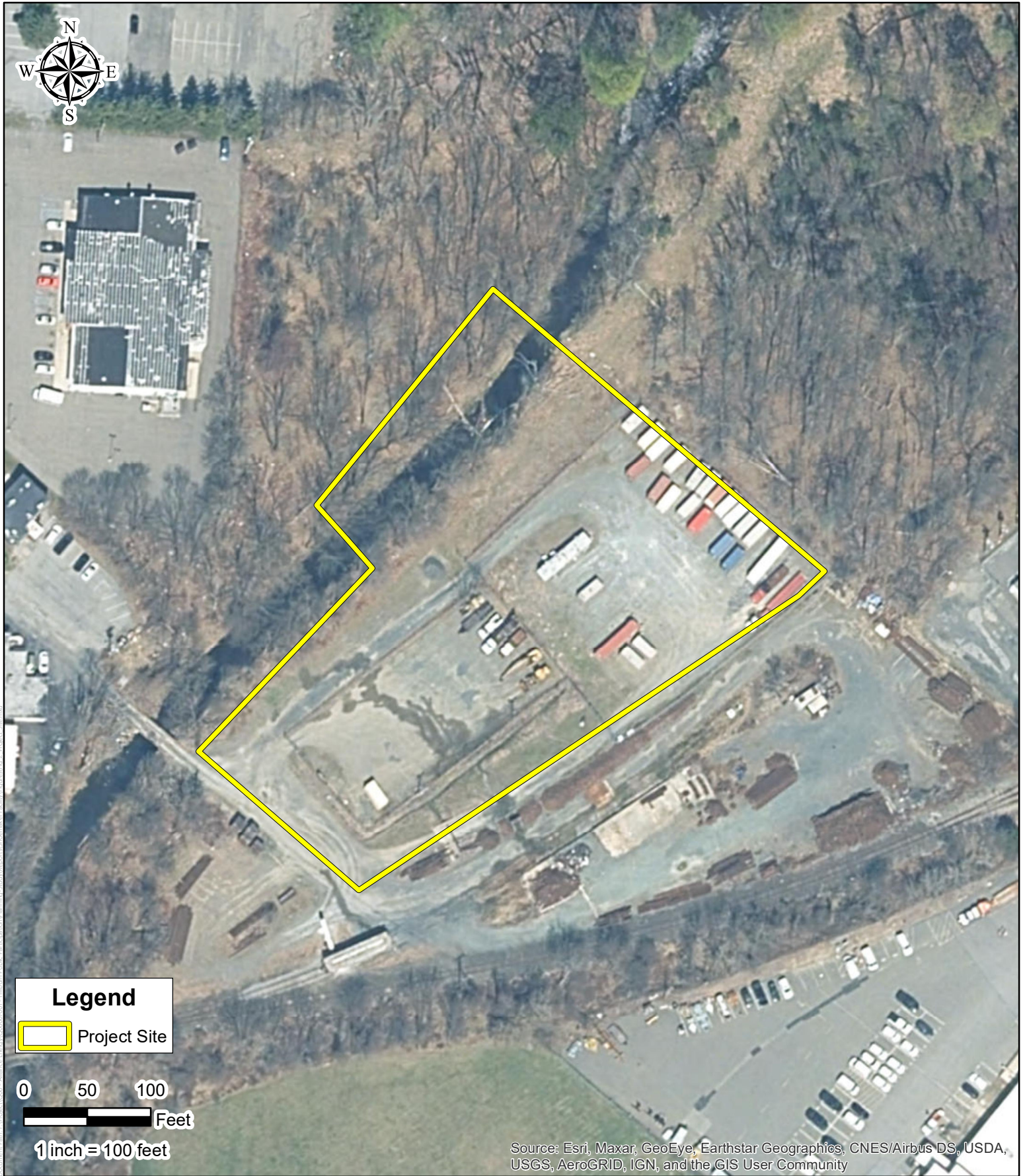
Figure 2 | Project Site

Shoemaker Gas Turbine Facility 71 Dolson Avenue Middletown, 10940